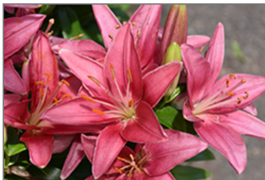
Tiny Pearl Lily flowers