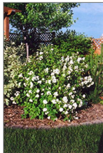
Buckley's Quill Mockorange in bloom