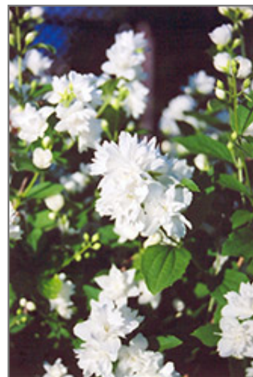
Buckley's Quill Mockorange flowers