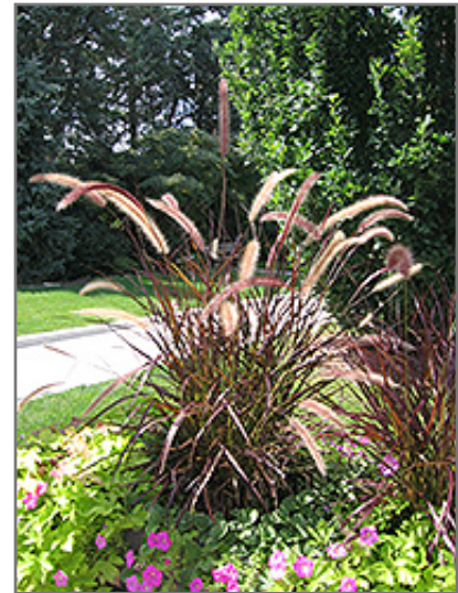
Purple Fountain Grass flowers

Purple Fountain Grass is recommended for the following landscape applications;