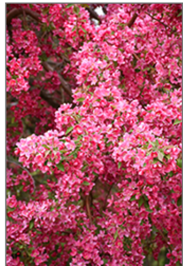
Prairifire Flowering Crab flowers