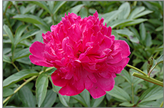
Felix Crousse Peony flowers

Felix Crousse Peony will grow to be about 30 inches tall at maturity, with a spread of 24 inches. The flower stalks can be weak and so it may require staking in exposed sites or excessively rich soils. It grows at a slow rate, and under ideal conditions can be expected to live for approximately 20 years. As an herbaceous perennial, this plant will usually die back to the crown each winter, and will regrow from the base each spring. Be careful not to disturb the crown in late winter when it may not be readily seen!