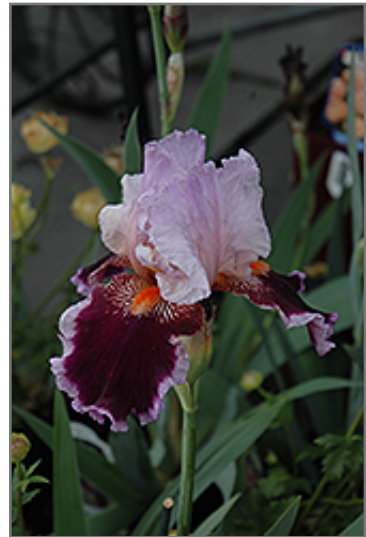
Armageddon Iris flowers