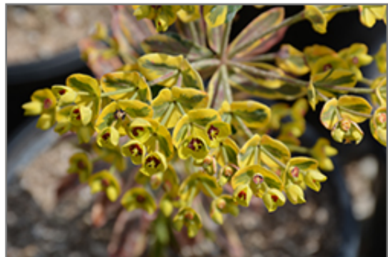
Ascot Rainbow Variegated Spurge flowers