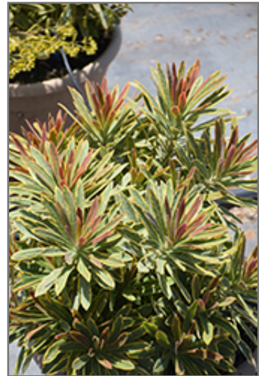
Ascot Rainbow Variegated Spurge foliage

Ascot Rainbow Variegated Spurge is recommended for the following landscape applications;