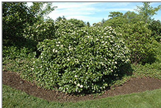
Raspberry Tart Viburnum in bloom

This shrub does best in full sun to partial shade. It prefers to grow in average to moist conditions, and shouldn't be allowed to dry out. It is not particular as to soil type or pH. It is highly tolerant of urban pollution and will even thrive in inner city environments. This is a selection of a native North American species.