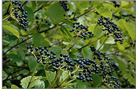
Raspberry Tart Viburnum fruit

This is a relatively low maintenance shrub, and should only be pruned after flowering to avoid removing any of the current season's flowers. It is a good choice for attracting birds to your yard, but is not particularly attractive to deer who tend to leave it alone in favor of tastier treats. It has no significant negative characteristics.