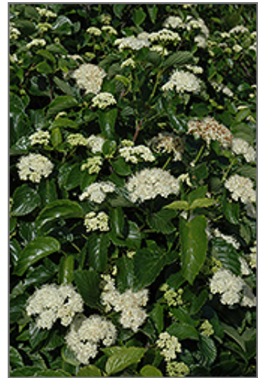
Raspberry Tart Viburnum flowers