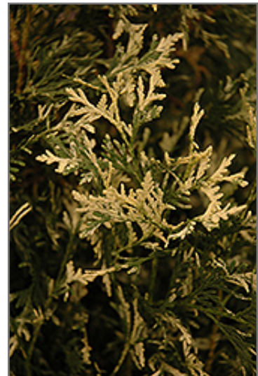
Wansdyke Silver Arborvitae foliage