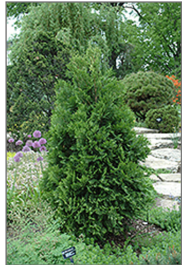
Wansdyke Silver Arborvitae