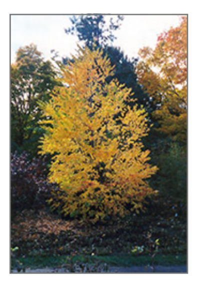
Katsura Tree in fall

This tree should only be grown in full sunlight. It prefers to grow in average to moist conditions, and shouldn't be allowed to dry out. It is particular about its soil conditions, with a strong preference for rich, acidic soils. It is somewhat tolerant of urban pollution, and will benefit from being planted in a relatively sheltered location. This species is not originally from North America.