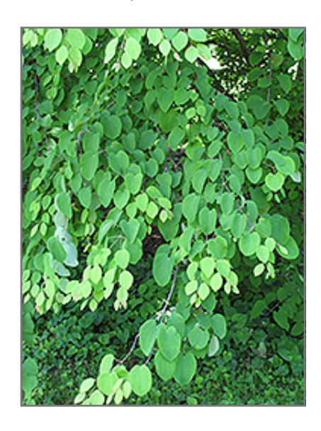
Katsura Tree foliage