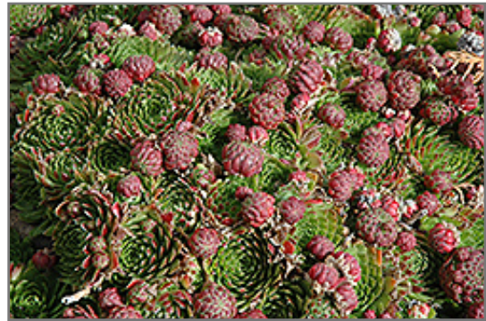
Red Beauty Hens And Chicks

This plant will require occasional maintenance and upkeep, and should not require much pruning, except when necessary, such as to remove dieback. Deer don't particularly care for this plant and will usually leave it alone in favor of tastier treats. Gardeners should be aware of the following characteristic(s) that may warrant special consideration;