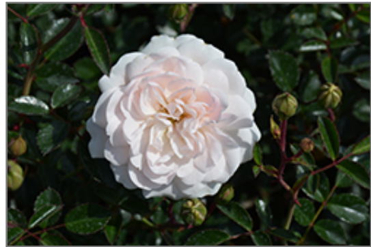
Sea Foam Rose flowers