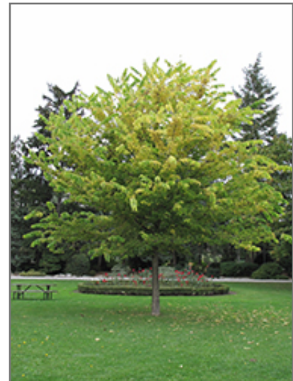
Common Hackberry in fall