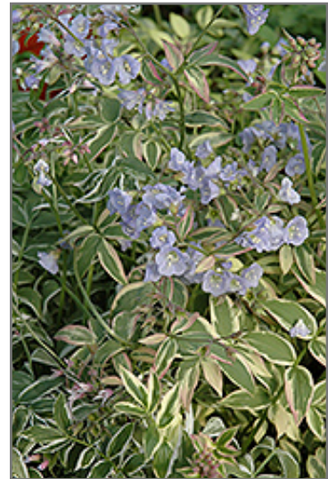
Touch Of Class Jacob's Ladder flowers

Touch Of Class Jacob's Ladder is recommended for the following landscape applications;