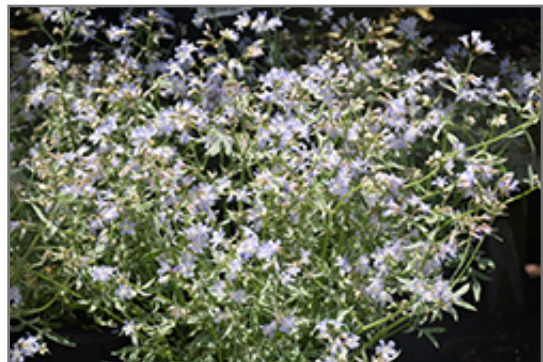
Touch Of Class Jacob's Ladder flowers