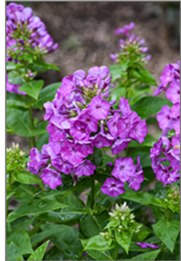
Purple Flame Garden Phlox flowers

Purple Flame Garden Phlox is recommended for the following landscape applications;