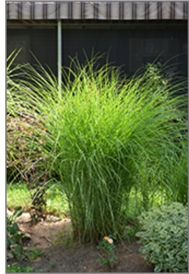
Gracillimus Maiden Grass

This plant does best in full sun to partial shade. It prefers to grow in average to moist conditions, and shouldn't be allowed to dry out. It is not particular as to soil type or pH. It is highly tolerant of urban pollution and will even thrive in inner city environments. This is a selected variety of a species not originally from North America. It can be propagated by division; however, as a cultivated variety, be aware that it may be subject to certain restrictions or prohibitions on propagation.