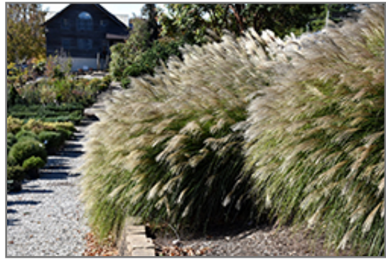
Gracillimus Maiden Grass

Gracillimus Maiden Grass is recommended for the following landscape applications;