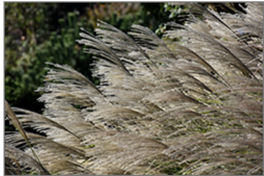
Gracillimus Maiden Grass fruit