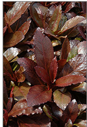
Queen Victoria Cardinal Flower foliage