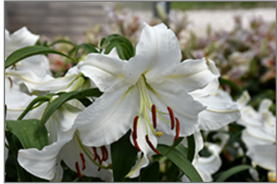
Casa Blanca Lily flowers