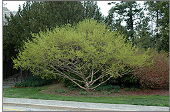
Golden Glory Dogwood in bloom

This tree does best in full sun to partial shade. It is very adaptable to both dry and moist locations, and should do just fine under average home landscape conditions. It is not particular as to soil type or pH. It is somewhat tolerant of urban pollution. Consider applying a thick mulch around the root zone in winter to protect it in exposed locations or colder microclimates. This is a selected variety of a species not originally from North America.