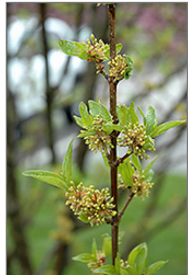
Golden Glory Dogwood flowers