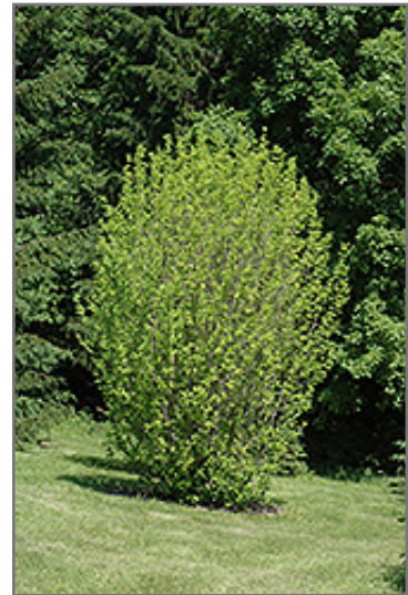
Golden Glory Dogwood

Golden Glory Dogwood is recommended for the following landscape applications;