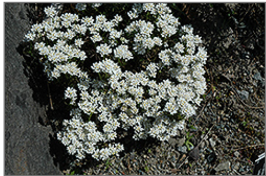
Snowflake Candytuft in bloom