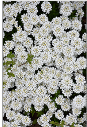
Snowflake Candytuft flowers