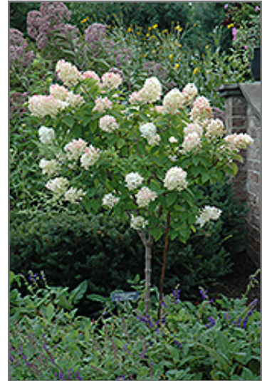
Limelight Hydrangea (tree form) in bloom

Limelight Hydrangea (tree form) will grow to be about 8 feet tall at maturity, with a spread of 6 feet. It tends to be a little leggy, with a typical clearance of 3 feet from the ground, and is suitable for planting under power lines. It grows at a medium rate, and under ideal conditions can be expected to live for 40 years or more.