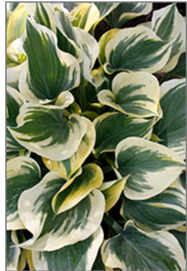
Liberty Hosta foliage