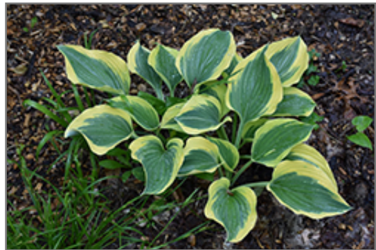
Liberty Hosta