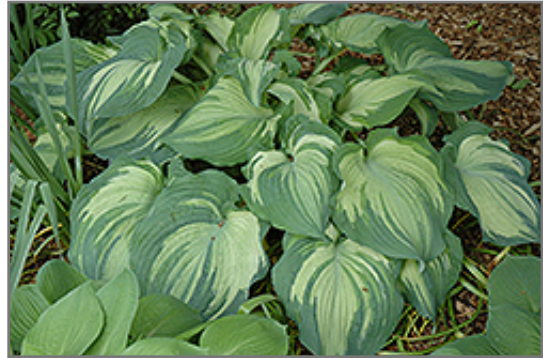
Guardian Angel Hosta

Guardian Angel Hosta will grow to be about 24 inches tall at maturity, with a spread of 3 feet. Its foliage tends to remain dense right to the ground, not requiring facer plants in front. It grows at a medium rate, and under ideal conditions can be expected to live for approximately 10 years. As an herbaceous perennial, this plant will usually die back to the crown each winter, and will regrow from the base each spring. Be careful not to disturb the crown in late winter when it may not be readily seen!