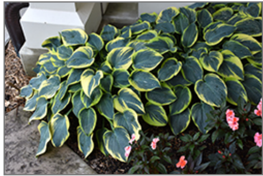
First Frost Hosta

This plant does best in partial shade to shade. It prefers to grow in average to moist conditions, and shouldn't be allowed to dry out. It is not particular as to soil type or pH. It is somewhat tolerant of urban pollution. This particular variety is an interspecific hybrid. It can be propagated by division; however, as a cultivated variety, be aware that it may be subject to certain restrictions or prohibitions on propagation.