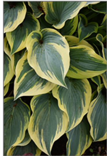
First Frost Hosta foliage

First Frost Hosta is recommended for the following landscape applications;