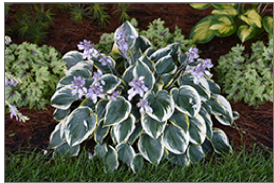
First Frost Hosta in bloom