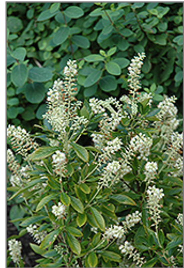
Hummingbird Summersweet flowers

Hummingbird Summersweet is recommended for the following landscape applications;