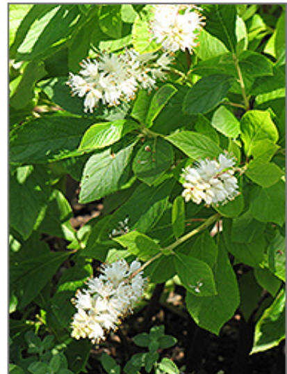
Hummingbird Summersweet flowers