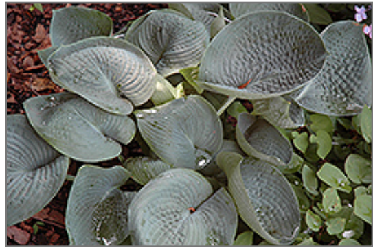
Abiqua Drinking Gourd Hosta foliage