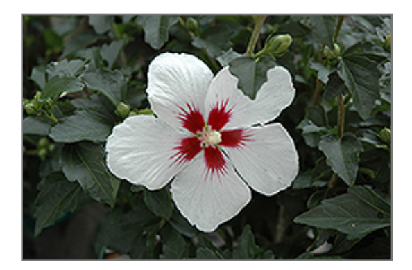
Lil' Kim Rose of Sharon flowers

Lil' Kim Rose of Sharon is recommended for the following landscape applications;