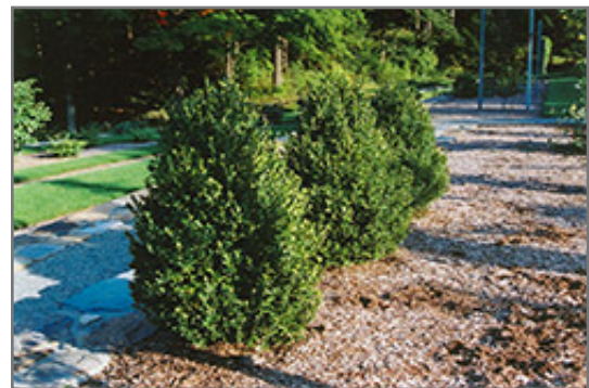
Green Mountain Boxwood