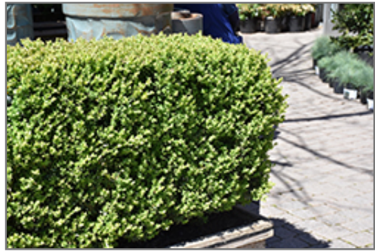
Green Mountain Boxwood