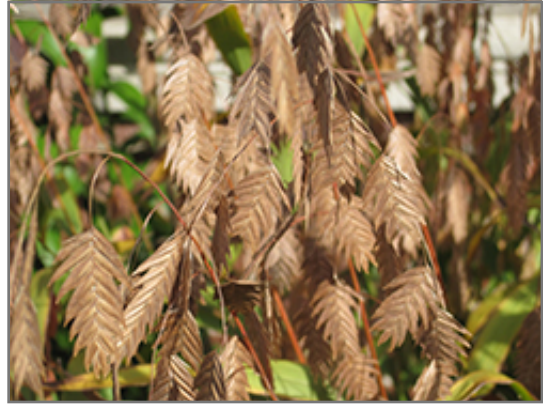
Northern Sea Oats Grass fruit

Northern Sea Oats Grass will grow to be about 24 inches tall at maturity extending to 5 feet tall with the flowers, with a spread of 30 inches. Its foliage tends to remain dense right to the ground, not requiring facer plants in front. It grows at a medium rate, and under ideal conditions can be expected to live for approximately 10 years. As an herbaceous perennial, this plant will usually die back to the crown each winter, and will regrow from the base each spring. Be careful not to disturb the crown in late winter when it may not be readily seen!