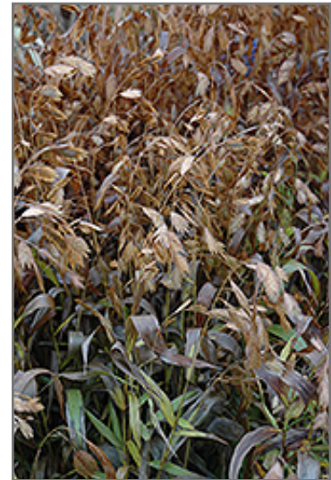
Northern Sea Oats Grass in fall

Northern Sea Oats Grass is recommended for the following landscape applications;