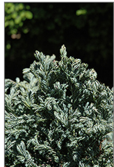
Curly Tops False Cypress foliage