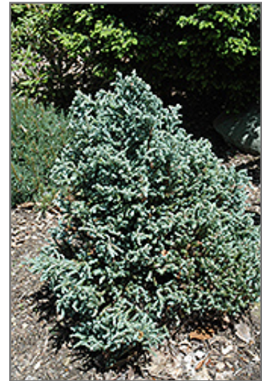
Curly Tops False Cypress

Curly Tops False Cypress is recommended for the following landscape applications;