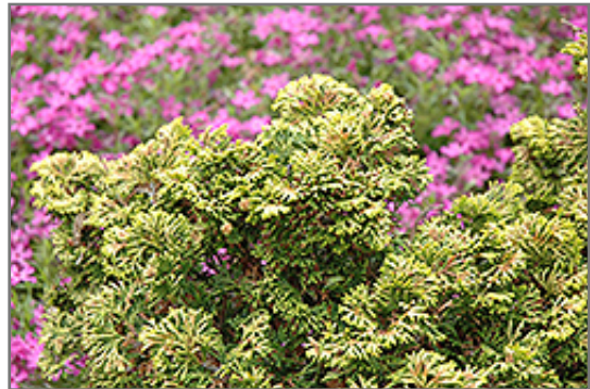
Verdon Dwarf Hinoki Falsecypress foliage