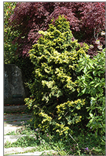
Verdon Dwarf Hinoki Falsecypress