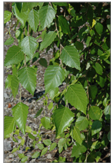
Summer Cascade Weeping River Birch foliage