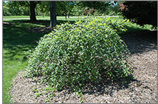
Summer Cascade Weeping River Birch