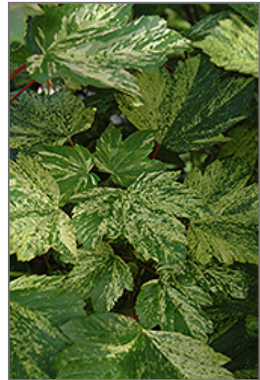
Variegated Sycamore Maple foliage