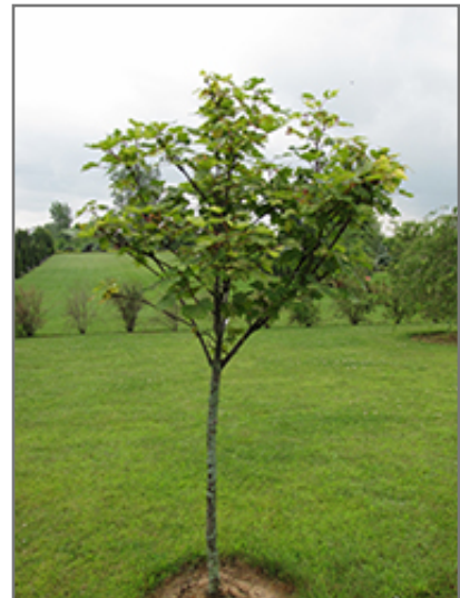
Variegated Sycamore Maple