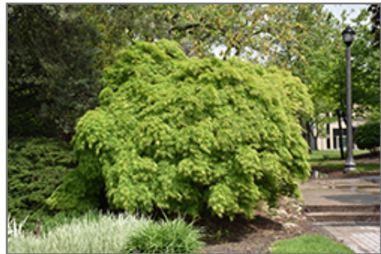
Viridis Japanese Maple