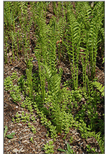
Interrupted Fern foliage

Interrupted Fern will grow to be about 3 feet tall at maturity, with a spread of 3 feet. It grows at a fast rate, and under ideal conditions can be expected to live for approximately 15 years. As an herbaceous perennial, this plant will usually die back to the crown each winter, and will regrow from the base each spring. Be careful not to disturb the crown in late winter when it may not be readily seen!