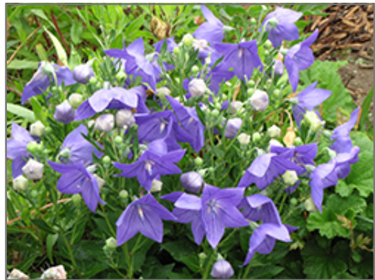
Sentimental Blue Balloon Flower in bloom