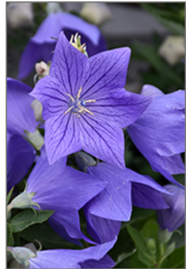
Sentimental Blue Balloon Flower flowers

Sentimental Blue Balloon Flower is recommended for the following landscape applications;