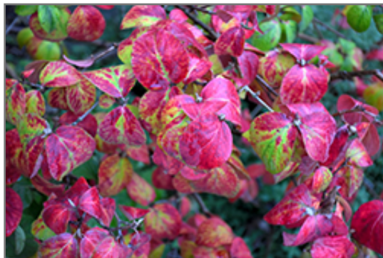
Koreanspice Viburnum in fall

This shrub does best in full sun to partial shade. It prefers to grow in average to moist conditions, and shouldn't be allowed to dry out. It is not particular as to soil type or pH. It is somewhat tolerant of urban pollution. This species is not originally from North America.