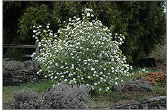
Koreanspice Viburnum in bloom

This is a relatively low maintenance shrub, and should only be pruned after flowering to avoid removing any of the current season's flowers. It is a good choice for attracting birds to your yard, but is not particularly attractive to deer who tend to leave it alone in favor of tastier treats. It has no significant negative characteristics.