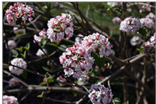
Koreanspice Viburnum flowers