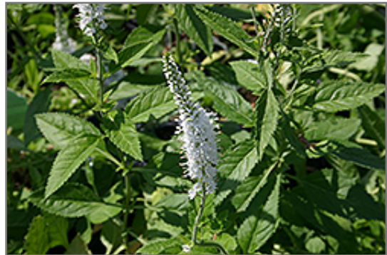
White Icicles Veronica flowers