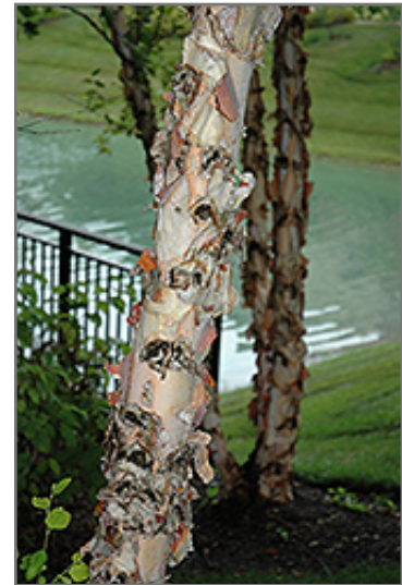
River Birch bark