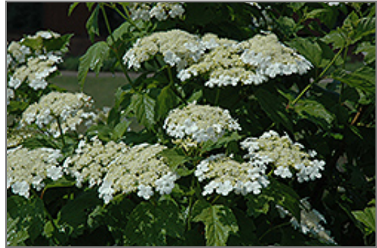
American Cranberrybush flowers