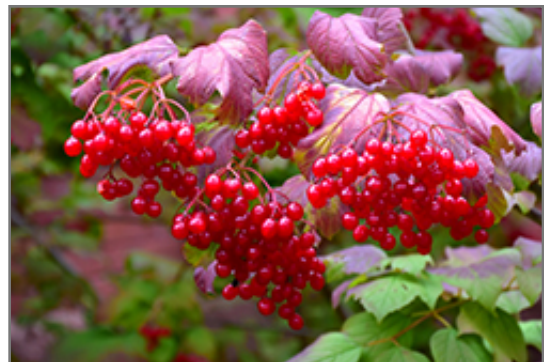
American Cranberrybush fruit