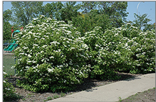
American Cranberrybush in bloom

American Cranberrybush is a multi-stemmed deciduous shrub with an upright spreading habit of growth. Its average texture blends into the landscape, but can be balanced by one or two finer or coarser trees or shrubs for an effective composition.