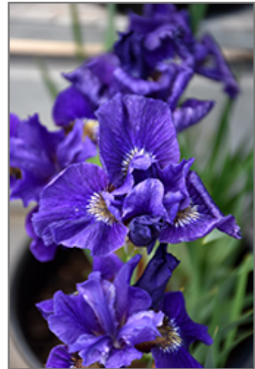
Ruffled Velvet Iris flowers