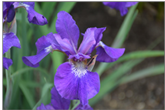
Ruffled Velvet Iris flowers