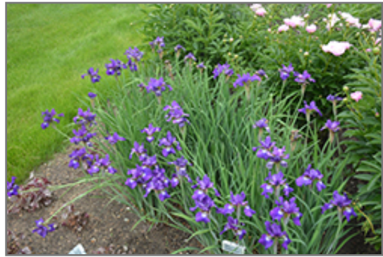
Ruffled Velvet Iris in bloom

This plant does best in full sun to partial shade. It is quite adaptable, preferring to grow in average to wet conditions, and will even tolerate some standing water. It is not particular as to soil type or pH. It is somewhat tolerant of urban pollution. This is a selected variety of a species not originally from North America. It can be propagated by division; however, as a cultivated variety, be aware that it may be subject to certain restrictions or prohibitions on propagation.