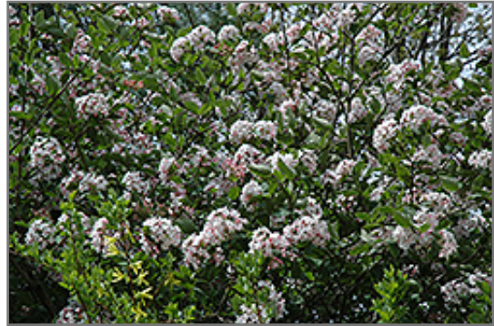
Judd's Viburnum flowers

This shrub does best in full sun to partial shade. It prefers to grow in average to moist conditions, and shouldn't be allowed to dry out. It is not particular as to soil type or pH. It is highly tolerant of urban pollution and will even thrive in inner city environments. This particular variety is an interspecific hybrid.