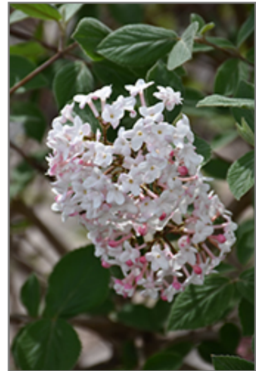
Judd's Viburnum flowers

This is a relatively low maintenance shrub, and should only be pruned after flowering to avoid removing any of the current season's flowers. It is a good choice for attracting birds to your yard, but is not particularly attractive to deer who tend to leave it alone in favor of tastier treats. It has no significant negative characteristics.