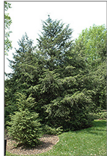
Eastern Hemlock