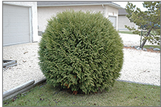
Woodward Globe Arborvitae

Woodward Globe Arborvitae will grow to be about 4 feet tall at maturity, with a spread of 8 feet. It tends to fill out right to the ground and therefore doesn't necessarily require facer plants in front. It grows at a slow rate, and under ideal conditions can be expected to live for approximately 30 years.