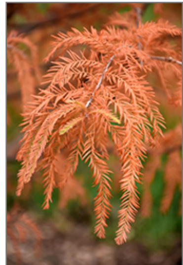
Baldcypress in fall