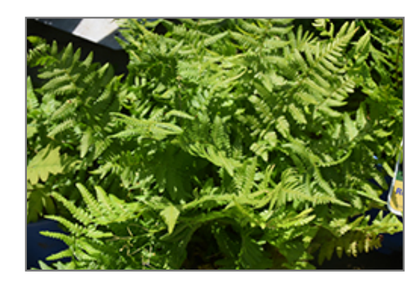
Robust Male Fern foliage

Robust Male Fern is recommended for the following landscape applications;