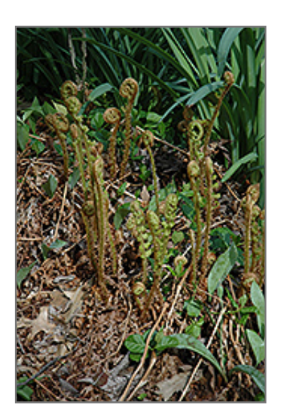
Robust Male Fern in spring