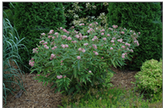
Cinderella Swamp Milkweed in bloom