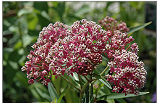
Cinderella Swamp Milkweed flowers

Cinderella Swamp Milkweed is recommended for the following landscape applications;