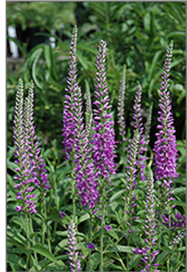
Eveline Veronica flowers