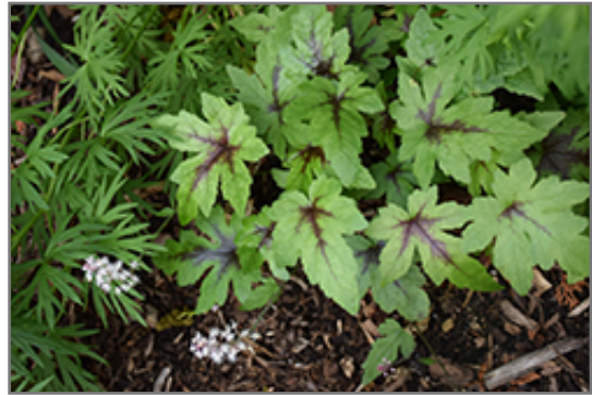
Sugar And Spice Foamflower foliage