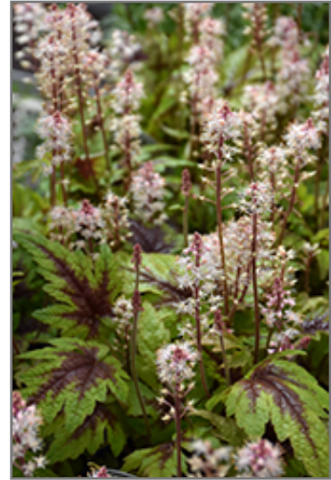
Sugar And Spice Foamflower flowers

Sugar And Spice Foamflower is recommended for the following landscape applications;