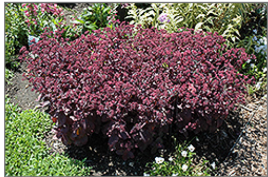
Xenox Sedum in bloom